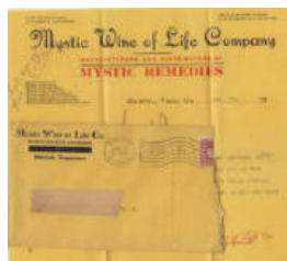
1910 Letterhead & Cover