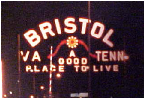
Mystic Wine of Life ?

While Bristol, Tenn-Va may not be a source of quantities of antique bottles today, it had a colorful and exciting history during the Whiskey and Patent Medicine Eras. One would be hard pressed to find a similar small town with as many different varieties of imaginatively named bottles.