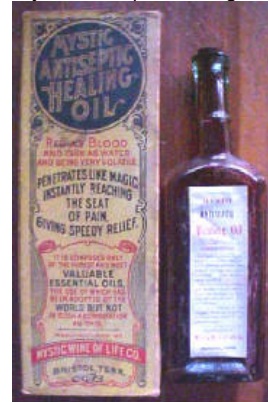
label only w/box