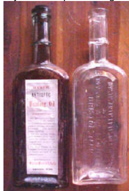
left is label only