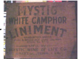
Mystic White Camphor Liniment wood crate