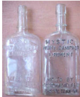
Bristol,Tenn & Bristol,Tenn-Va. variants