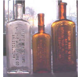
Mystic Wine of Life bottles