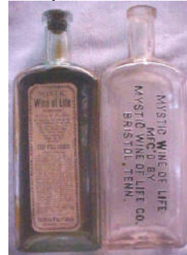
left - aq. label only