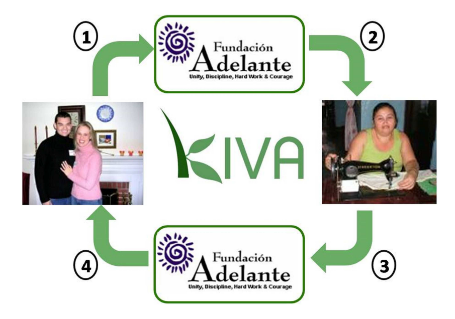
Figure 1.1: (1) Lenders browse profiles of entrepreneurs (2) Kiva's microfinance partners distribute the loan funds to the selected entrepreneurs (3) The entrepreneurs repay the loans; the repayments are posted on Kiva and emailed to the lenders (4) When lenders receive their money, they can re-lend to someone else or donate to Kiva